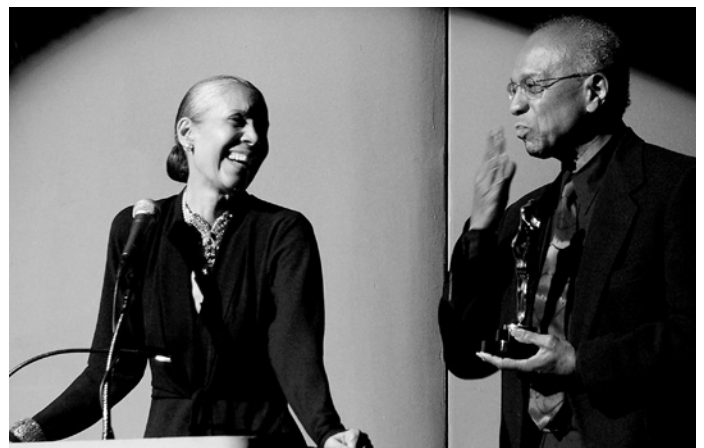
Donald McKayle, 2005 Lifetime Achievement Award recipient presenting the Lifetime Achievement Award to Carmen de Lavallade in 2004.